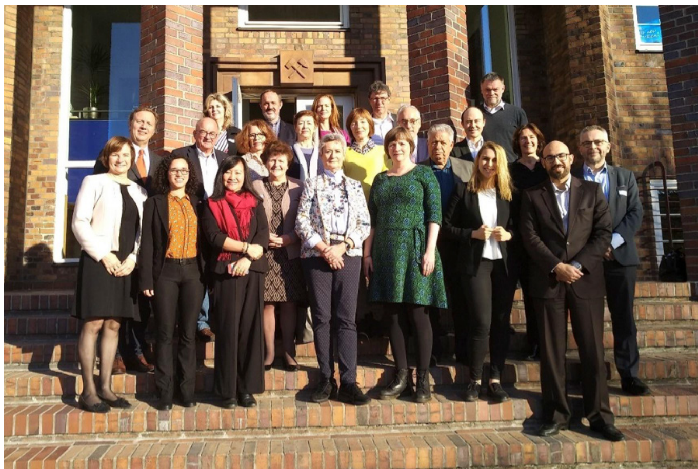
38th Annual General Assembly in Berlin, kindly hosted by the German Cancer Society